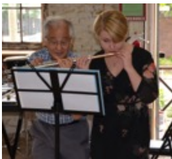
Lots of music and hidden talents!