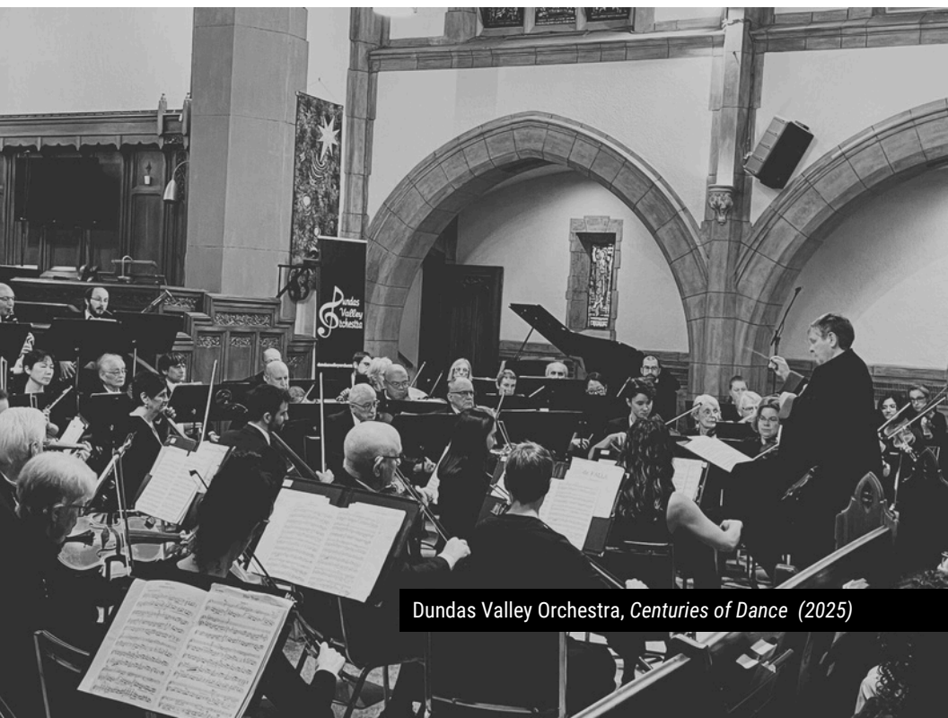
Dundas Valley Orchestra, Centuries of Dance (2025)