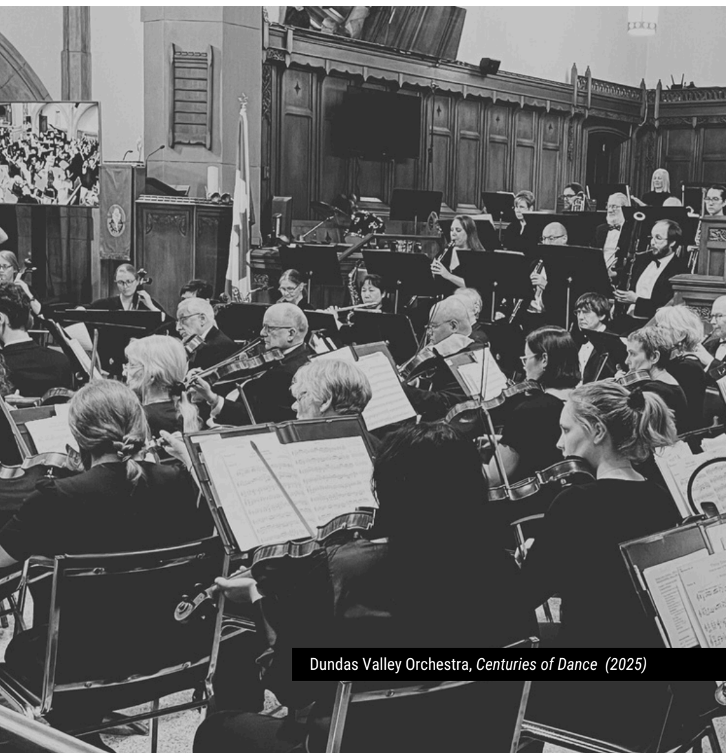
Dundas Valley Orchestra, Centuries of Dance (2025)